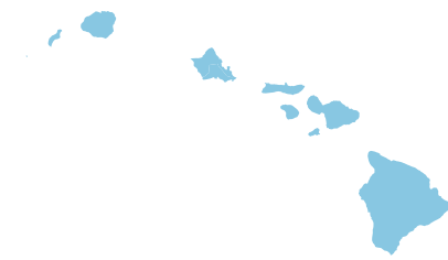
Number of Estimated Jobs Created by HH Industry between 2017-2022 1